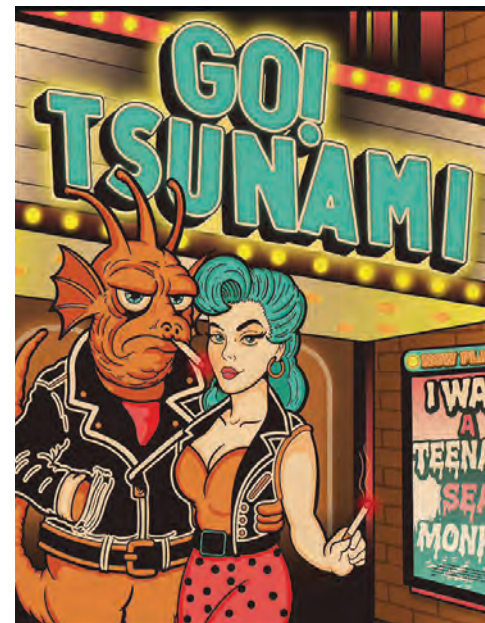
18 MUSIC | Go! Tsunami

FREE May 28-June 3, 2026 • Vol. 51, No. 44