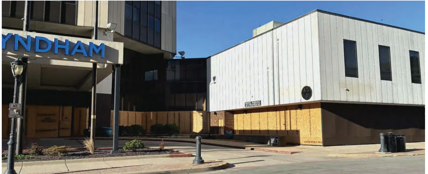
The Wyndham Springfield City Centre Hotel has been closed since March 27, 2025, when it was damaged by internal flooding.