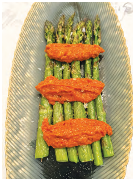
17 FOOD | Getting sauced