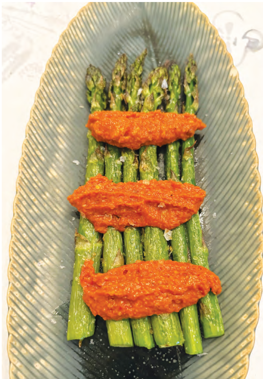
Grilled asparagus with Romesco sauce.

This easy method produces a technically sound romesco sauce. I love to serve it with grilled vegetables. Makes about 2 cups