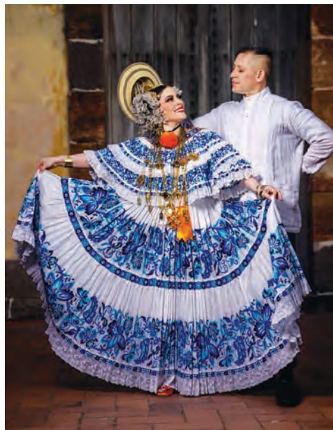
27 ART | Cultural Arts Festival