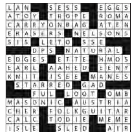
Crossword answers from #946