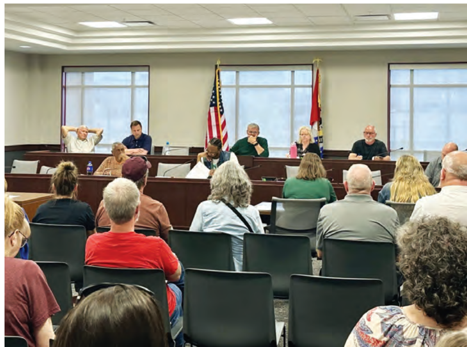
Sangamon County's Zoning and Land Use Committee met May 21 but a proposal to amend the county's data center ordinance remained tabled.