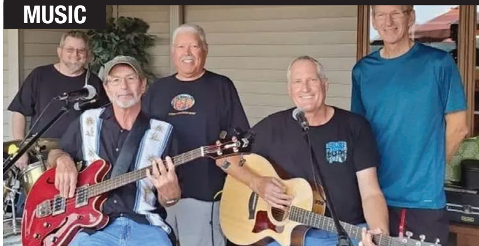
Jonnie Concaroo Band plays Harvest Market Farmhouse Brews this Friday.