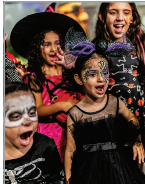
21 IT PICK | Zoolie Ghoulie

FREE October 23-29, 2025 • Vol. 51, No. 13