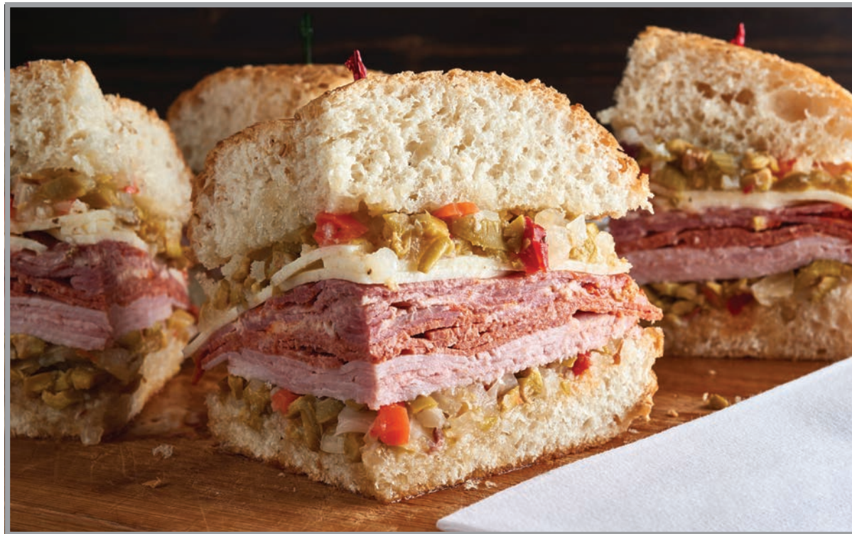
Muffaletta sandwich.