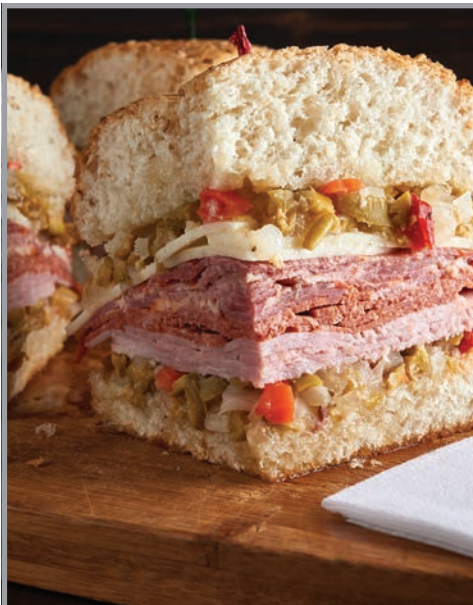
16 FOOD | Party sandwiches