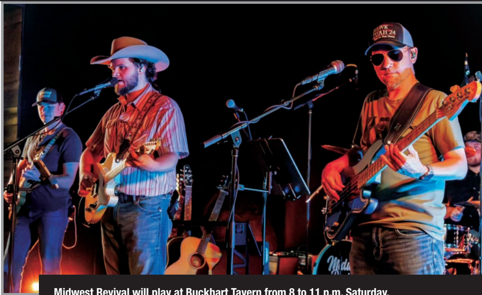
Midwest Revival will play at Buckhart Tavern from 8 to 11 p.m. Saturday.

Karaoke Silver Sevens Gaming Pub & Parlor, 8pm-12am