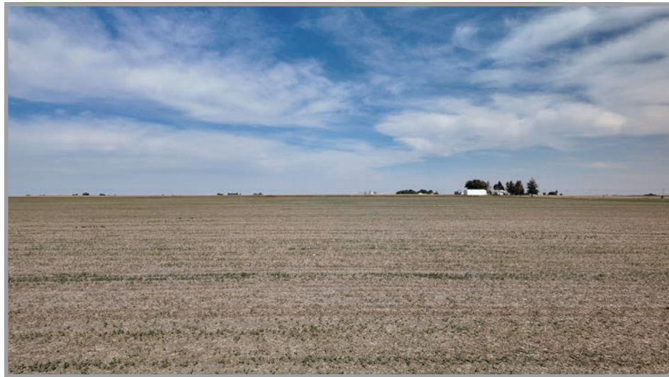
The first data center in Sangamon County is slated to be located here – west of the intersection of Thayer and Clark roads in Talkington Township, 14 miles southwest of Springfield, across the road from the recently completed Double Black Diamond solar farm installation.

The zoning request is scheduled to be considered for a nonbinding recommendation Nov. 20 by the Sangamon County Zoning Board of Appeals. The Sangamon County Board would have the final say and could vote as soon as its Dec. 9