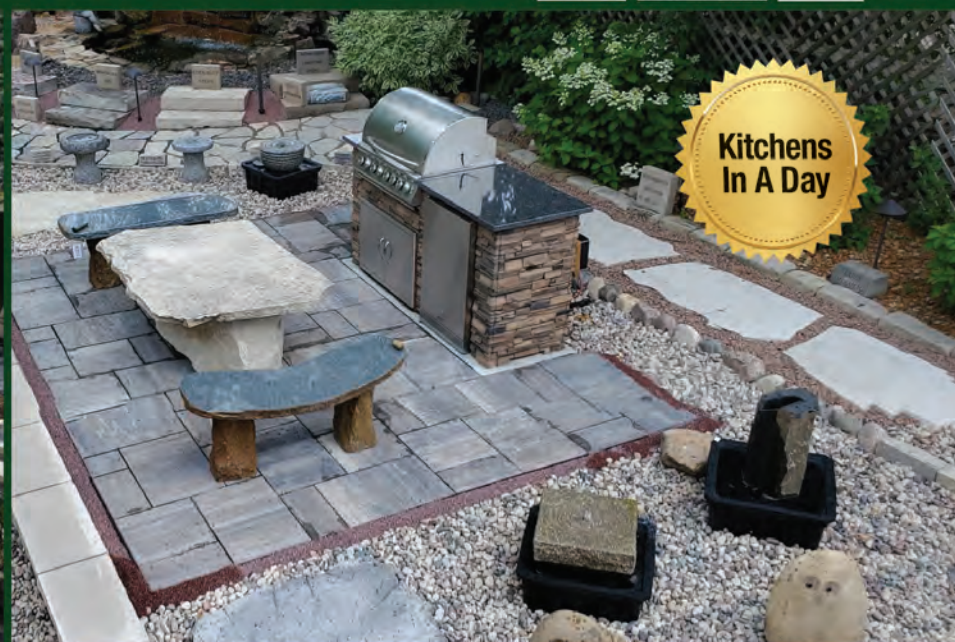
Kitchens In A Day