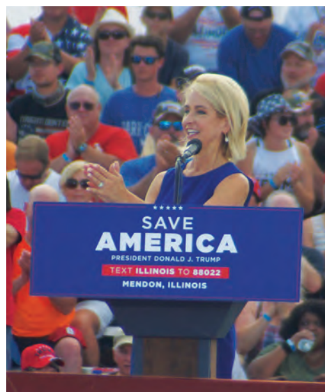
U.S. Rep. Mary Miller at a rally in Adams County June 25 where former President Donald Trump endorsed her in the primary race against U.S. Rep. Rodney Davis.