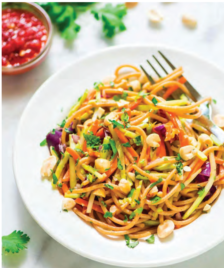
Pan-Asian noodle salad.

Cook the noodles according to the package directions. When finished cooking, rinse the noodles under cold water then drain them well. Toss the noodles with one tablespoon of sesame oil and the juice of half a lime, then set them aside to cool while you prepare the sauce and vegetables.