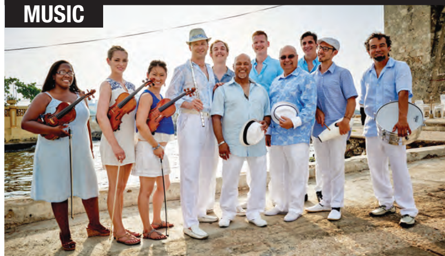
Charanga Tropical plays Cuban-infused Latin music at the Y-Block this Thursday for the Levitt AMP concert music series.