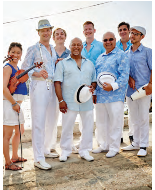
16 MUSIC | Charanga Tropical

FREE June 30-July 6, 2022 • Vol. 47, No. 50