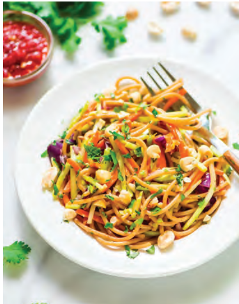
18 FOOD | Salad the main course