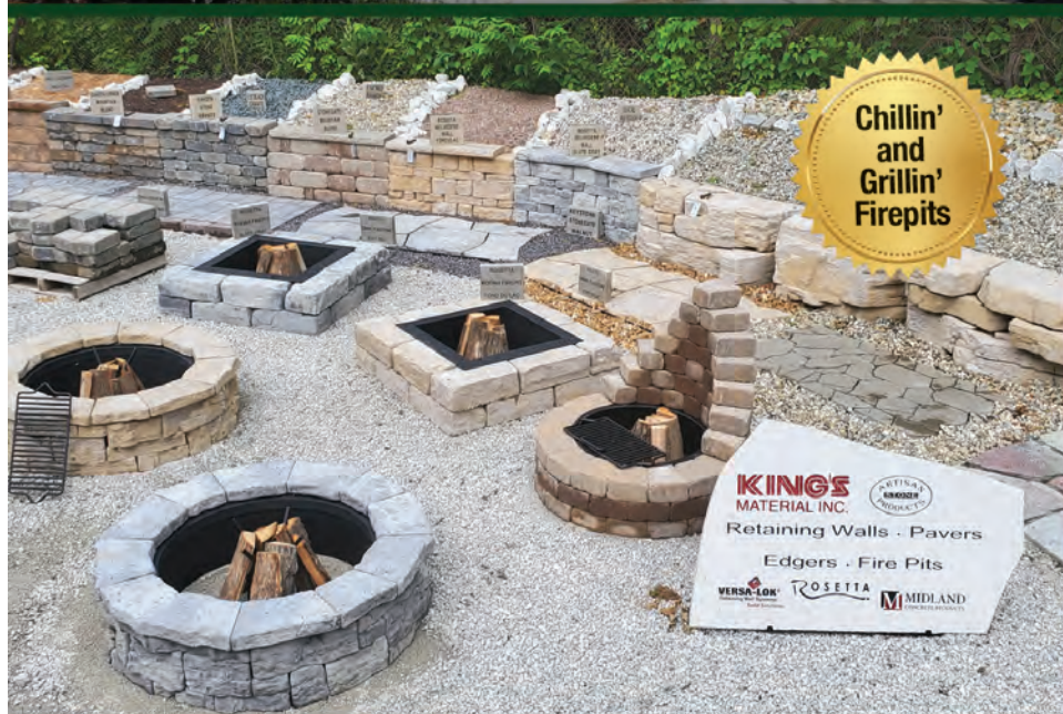
Chillin' and Grillin' Firepits