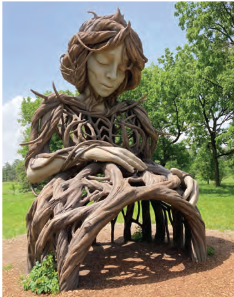
10 TRAVEL | Short summer trips