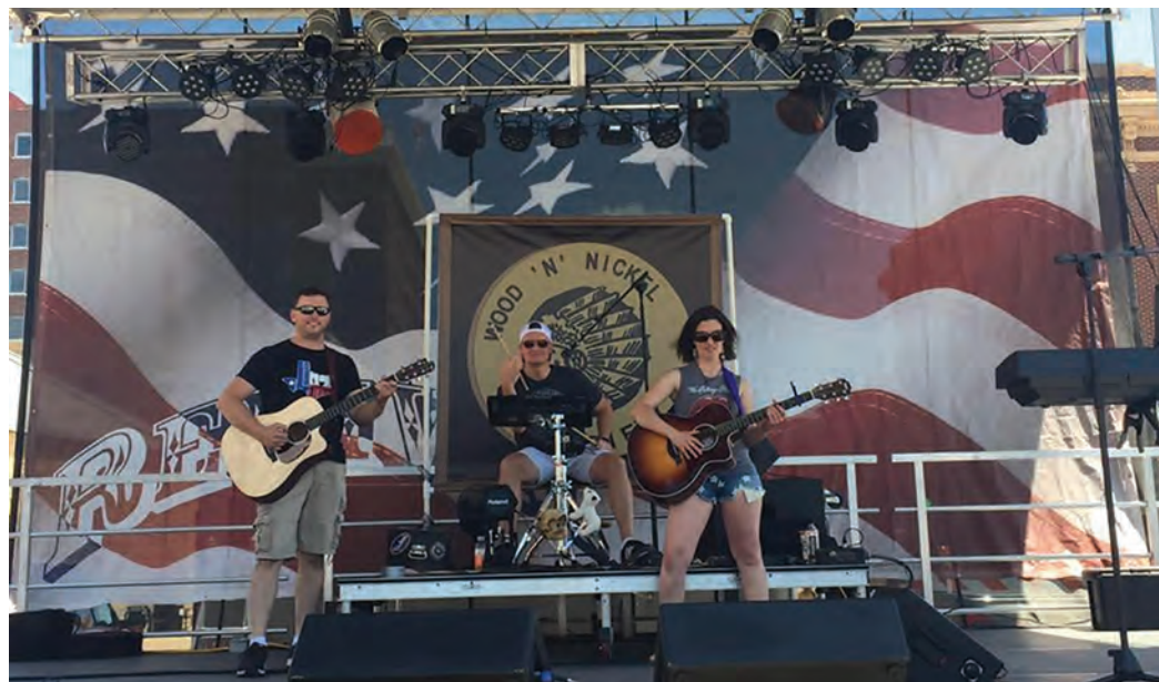
Wood 'n' Nickel Society plays Saturday on the Y Block Main Stage.