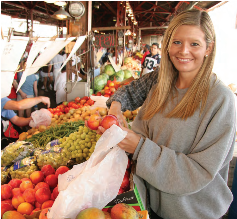
Souland Market, just south of downtown St. Louis, is one of the oldest farmers markets in the United States.