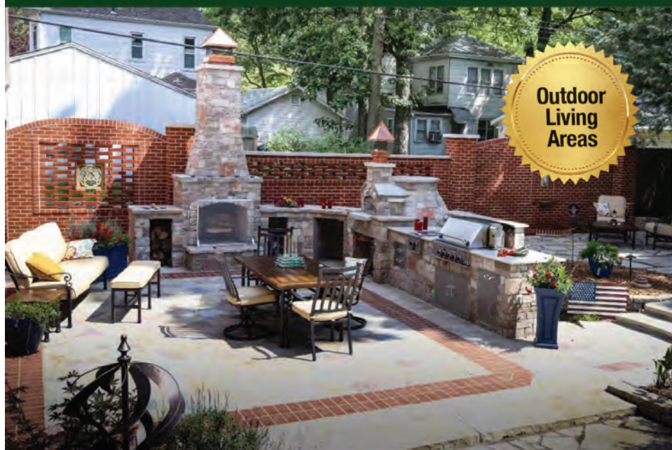
Outdoor Living Areas