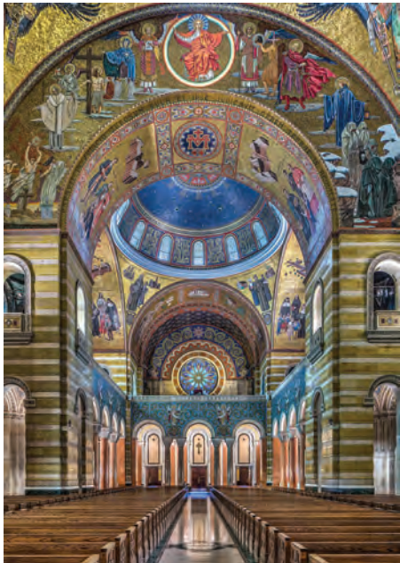
Thousands of mosaics cover the walls and ceiling of the Cathedral Basilica of St. Louis, rivaling the grandeur of many European cathedrals.

sit among tall trees. The Robert R. McCormick House, home to the park's founder and longtime Chicago Tribune publisher, is closed for renovations. Eight miles away in Lisle, you can view